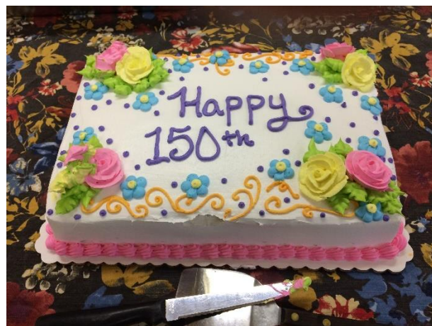
Our Celebration cake at our March Team Meeting

REMINDER: Issues of the North East District "SHOFAR" and "Catch a Vision" are available at: www.wisconsinumw.org (click on Communications)