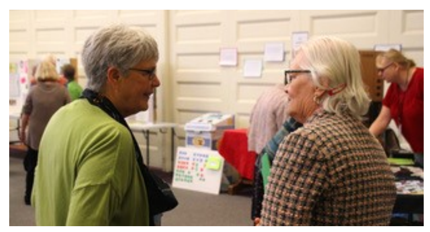
UMW members checking out the displays