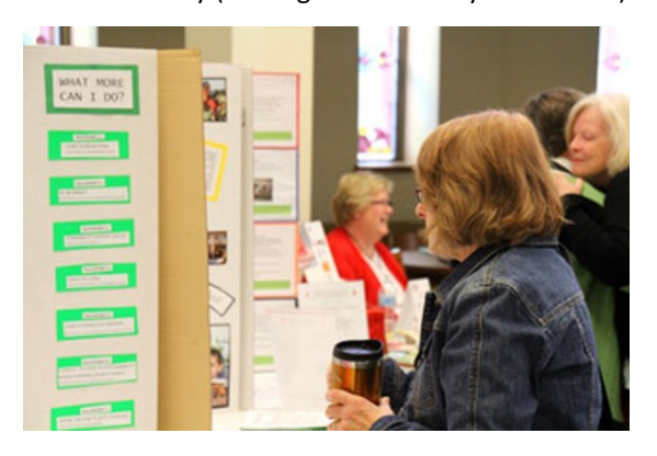
UMW members checking out the information displays