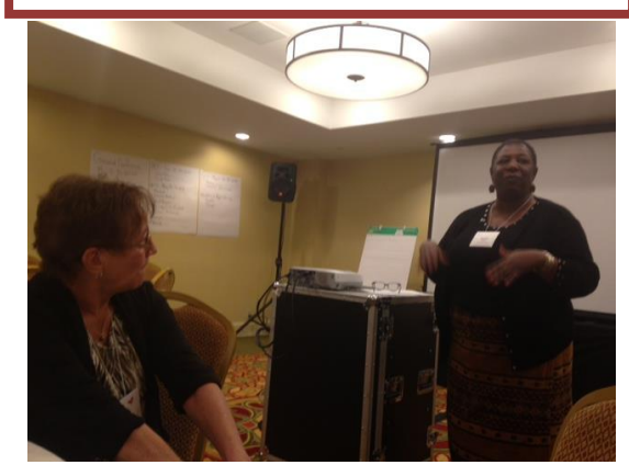
Jurisdiction Training Event

Be Just Be Green Jurisdiction Guides NCJ Guides: 1<sup>st</sup> from left & 4<sup>th</sup> from left