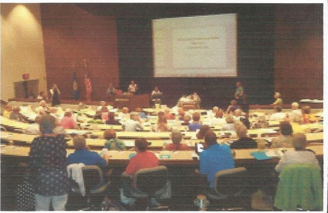
Plenary meeting at 2014 Mission u in Westwood.

United Methodist Women FAITH - HOPE - LOVE IN ACTION