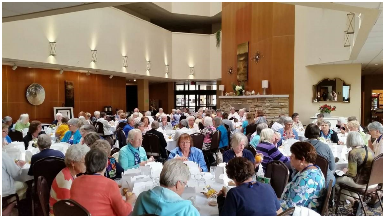
UMW Ladies enjoying fellowship, while eating lunch