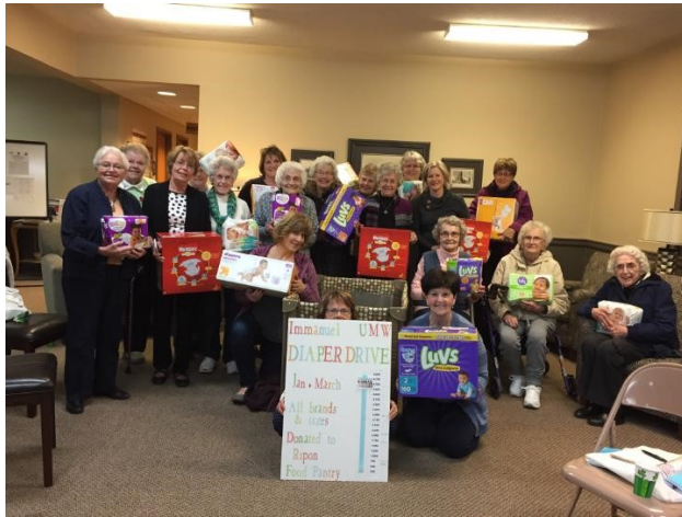
Left: IUMW posing with the diaper display during a recent meeting.